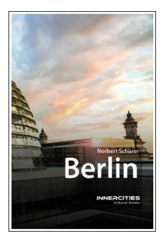
Filesize: 5.62 MB