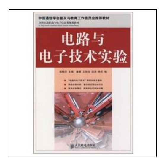
Filesize: 2.1 MB