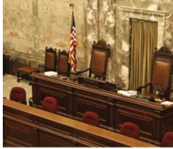
Evaluation of the State of Colorado's Care and Treatment Th Mentally Ill, Title 27, Article 10: A Report From the Colorado Department of Human Services, Division of Behavioral Health