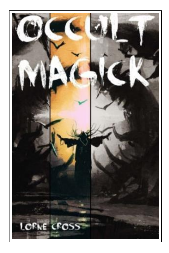
Filesize: 6.85 MB