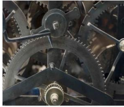
RECOVERY OF GOVERNMENT WASTE PAPER