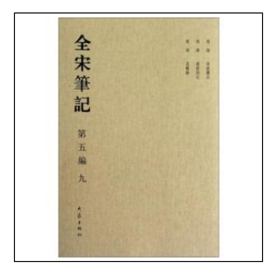
Filesize: 6.94 MB