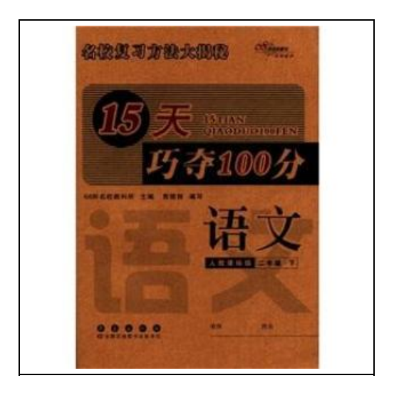
Filesize: 2.15 MB