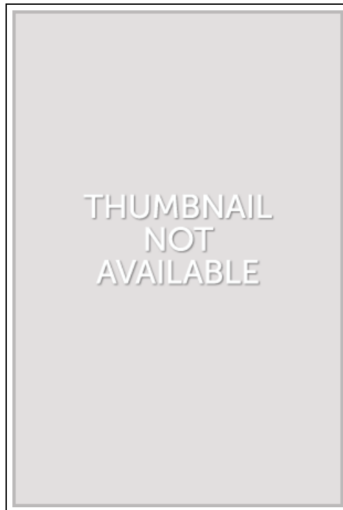
Figure that the urban infrastructure and Countermeasures Disease Series: Illustrated city roads diseases and countermeasures(Chinese Edition)