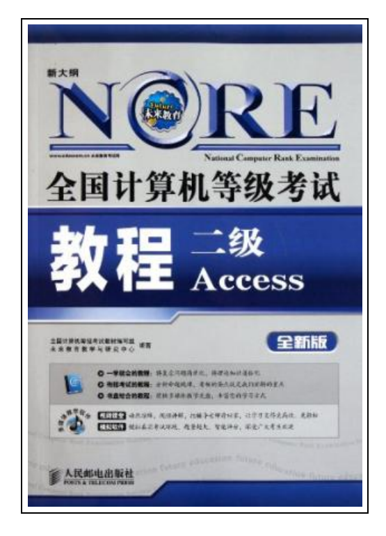
Filesize: 2.94 MB