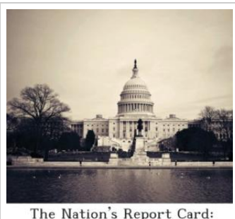
The Nation's Report Card: Trial Urban District Assessment Mathematics 2011