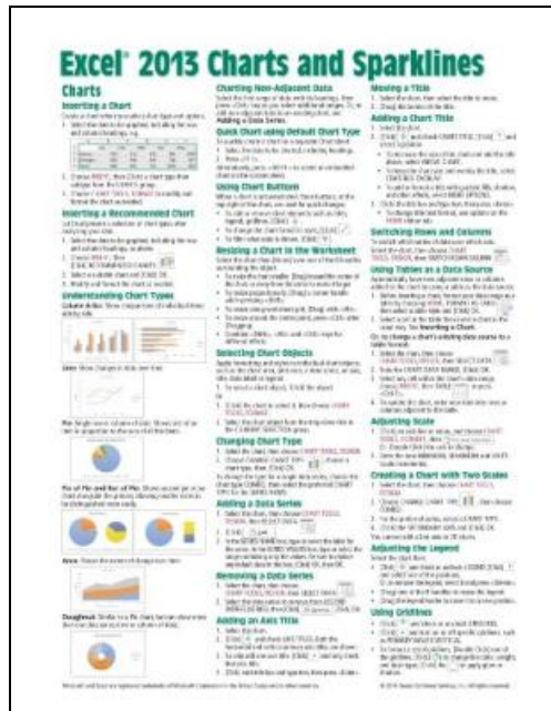
Filesize: 4.32 MB