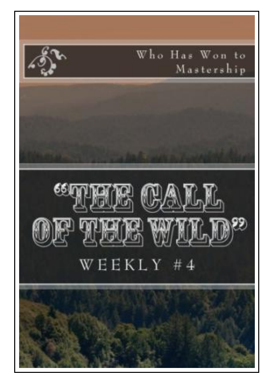
Filesize: 4.26 MB