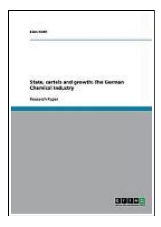
Filesize: 2.39 MB