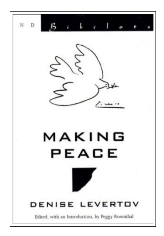
Filesize: 6.88 MB