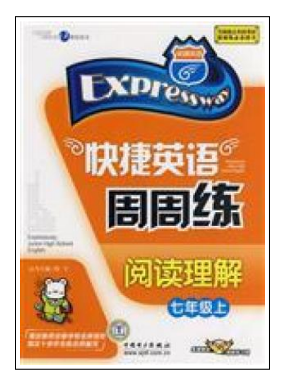
Filesize: 2.31 MB