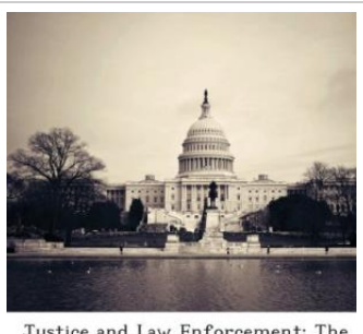
Justice and Law Enforcement: The District of Columbia Can Pay More Vendors on Time: GGD-83-38

U.S. Government Accountability Office (GAO)