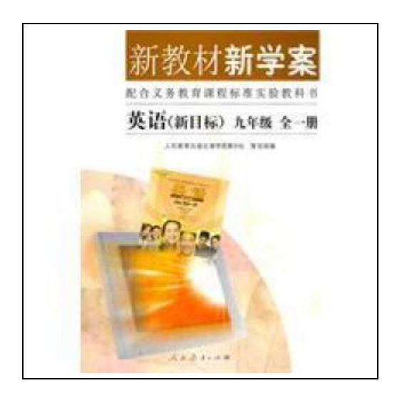
Filesize: 9.32 MB