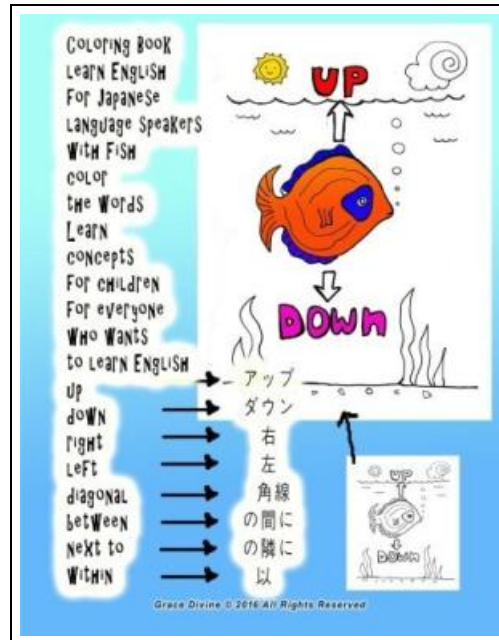
Filesize: 7.52 MB