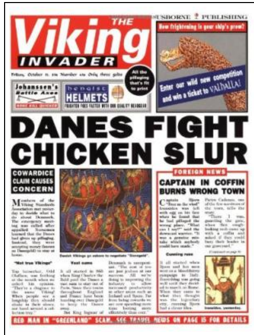
Filesize: 8.14 MB