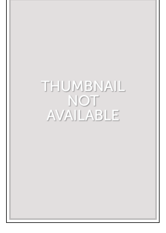
Filesize: 2.77 MB