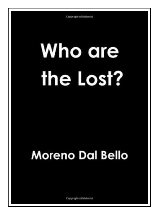
Filesize: 9.43 MB