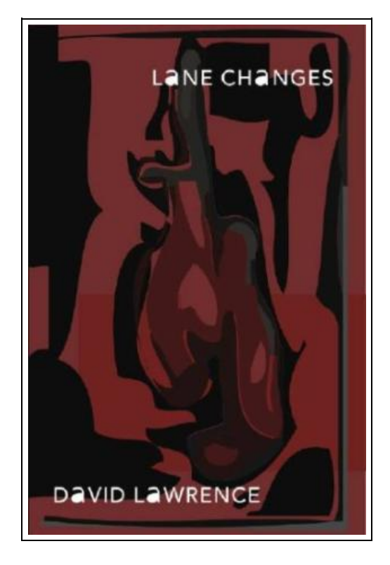
Filesize: 6.66 MB