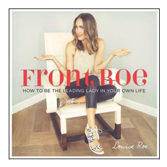
Filesize: 5.17 MB