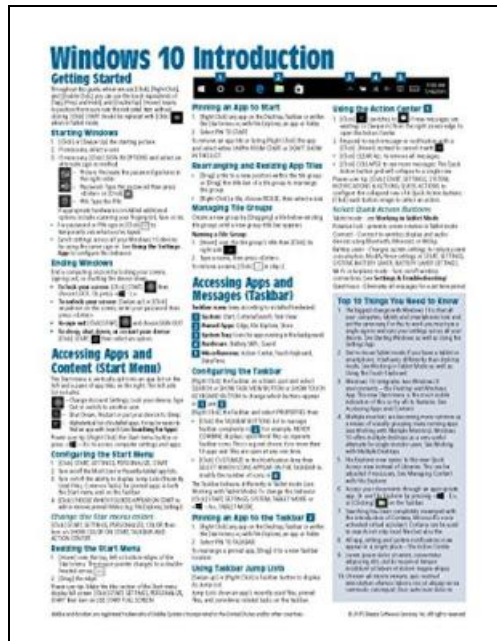
Filesize: 6 MB