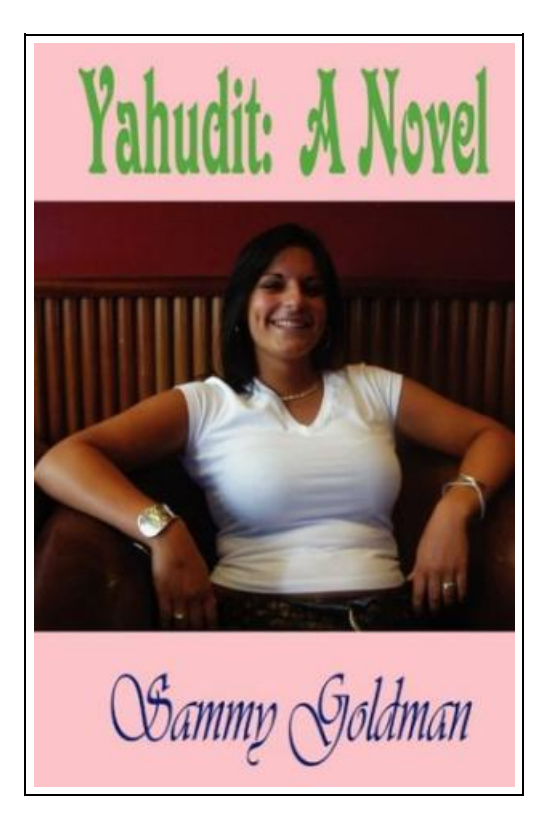
Filesize: 5.45 MB