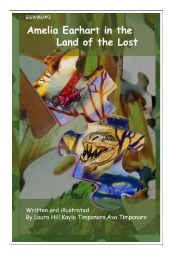
Filesize: 3.75 MB