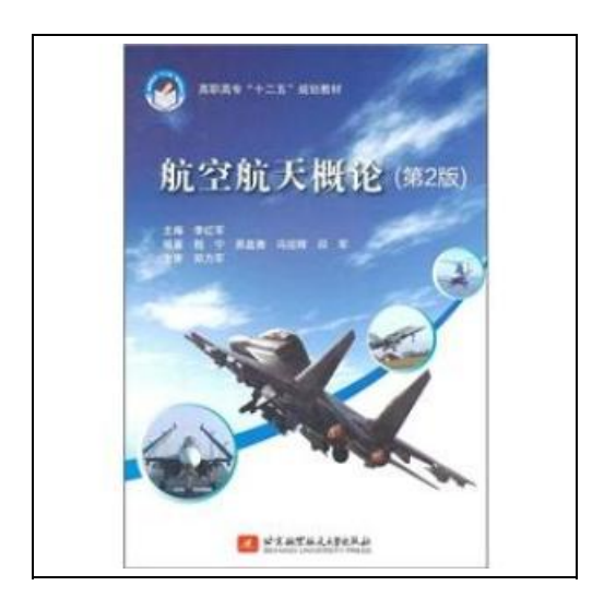
Filesize: 2.15 MB